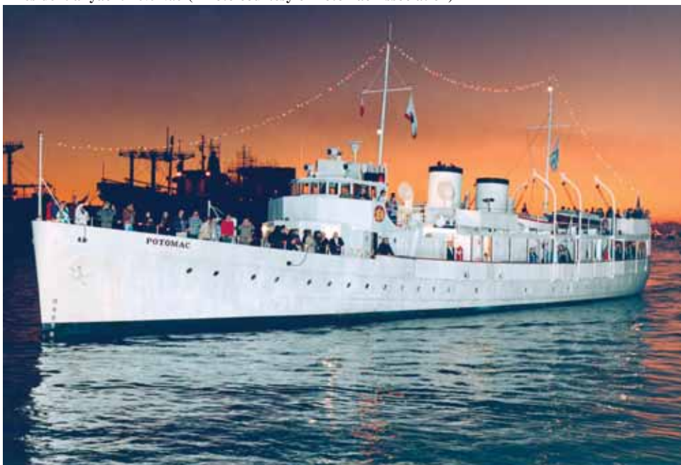
Presidential yacht Potomac