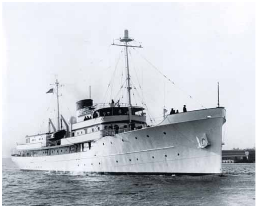
USS Williamsburg

Next placed in presidential service in 1933 was the ship probably best known to all, the USS Sequoia . Built in 1926 as a private yacht, she was employed by the Commerce Department for Prohibition patrol duties in 1931-33. She remained in government service until 1977 when President Jimmy Carter had her sold at public auction as a symbolic cost-cutting action. In corporate hands today and meticulously restored, the Sequoia has been designated a national historic landmark, perhaps the most important piece of Americana not owned by the government. She continues to carry passengers in luxury and elegance and is available for exclusive charters out of Washington, D.C. Sequoia was followed by yachts Potomac and Williamsburg used by both Truman and Eisenhower.