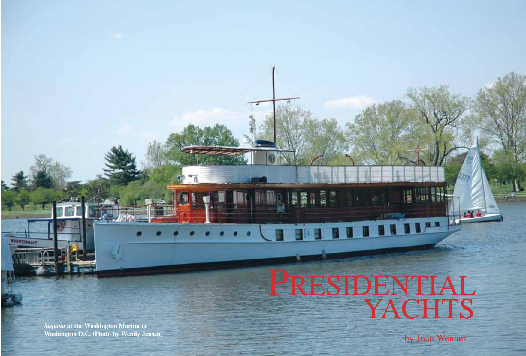
Sequoia at the Washington Marina in Washington D.C.