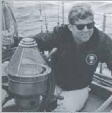
JFK at the helm of Manitou