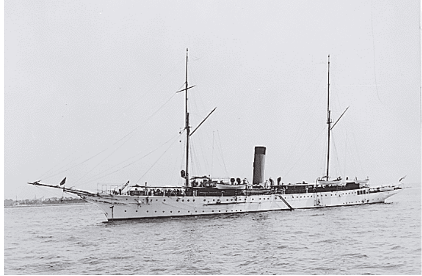
The Dolphin

Hoover decommissioned the Mayflower that same year.