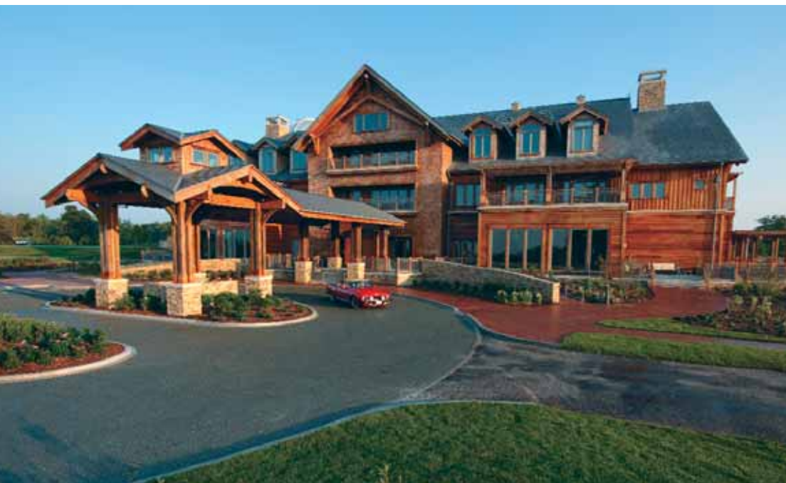
Primland's recently opened lodge offers luxurious accommodations in a resort atmosphere. See "Crossed Lines" on page 7 for more details

How are the birds flying? Most operations are releasing birds throughout the season depending on the vigor of each species at the time of your hunt. Consider choosing your quarry based on the facility's recommendations rather than your favorite species.