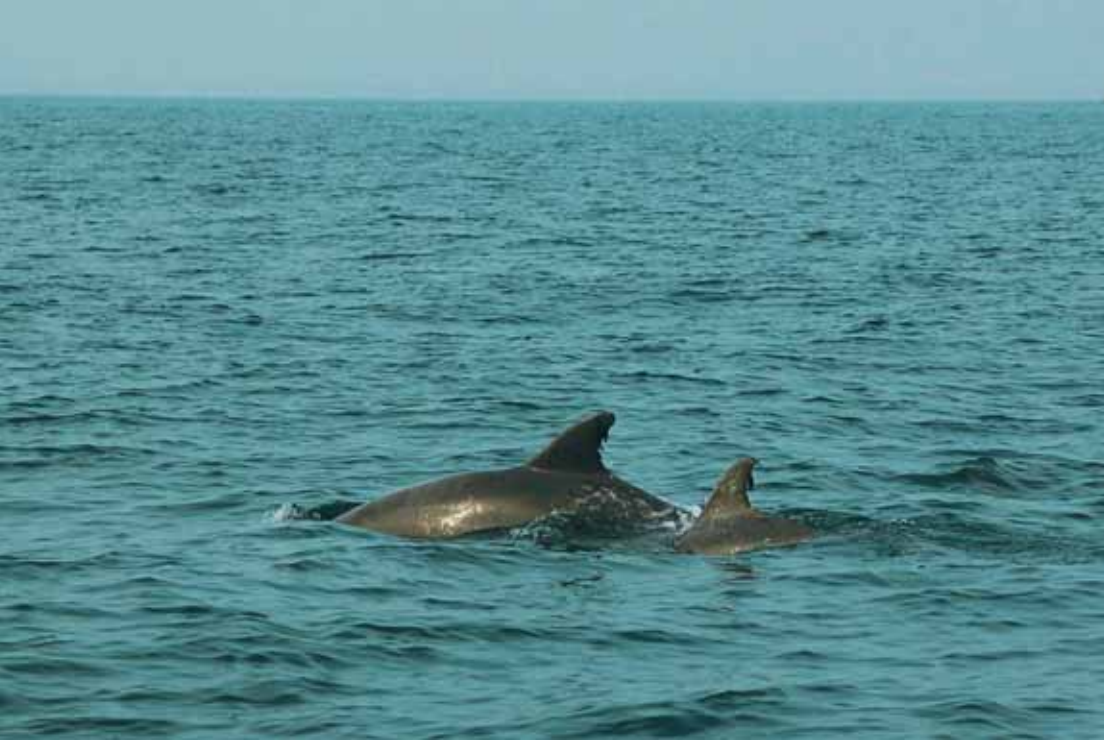
Dolphins often cavort on the Chesapeake Bay just outside Hampton.