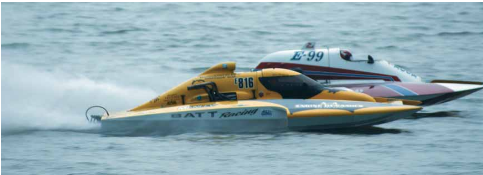
The 83rd Annual Hampton Cup Regatta will take place August 14-16. It is the nation's oldest continuously-running hydroplane boat race.

tunnels. Man-made islands anchor the ends of the tunnels, and these rip-rap structures usually yield the best fishing. The rip-rap, the 11,000 bridge pilings, and the rip currents caused by the structures provide ideal fishing year-round. Water depth along the CBBT ranges from 10 to 100 feet. Gamefish of all kinds, including striped bass, bluefish, black drum, various sea basses, spadefish, flounder, mackerel and others hang out and chase schools of menhaden and other baitfish. Some of the best fishing for striped bass is during the winter months, and at night under the bridge's