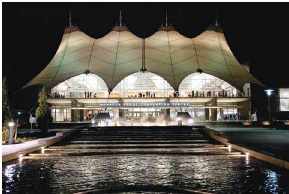
Hampton Roads Convention Center

as the National Advisory Committee for Aeronautics (NACA); and by 1935 it had also become the center for tactical aviation for the U.S. Army Air Corps. In 1958, NACA became NASA, the National Aeronautics and Space Administration. And in the spring of 1959, America's first Astronauts, the Mercury Seven, were chosen and began training at the NASA Langley Research Center in Hampton. Today, the