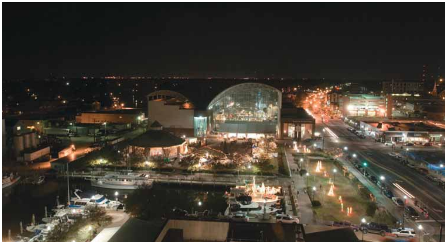
Downtown Hampton