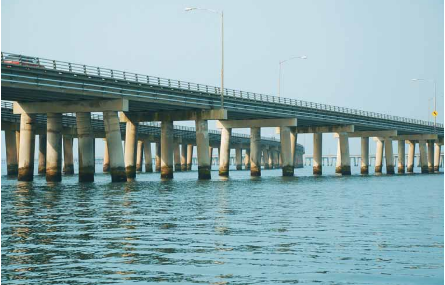
Some of the 11,000 pilings that support the CBBT. Most provide ambush spots and hiding cover for many gamefish.