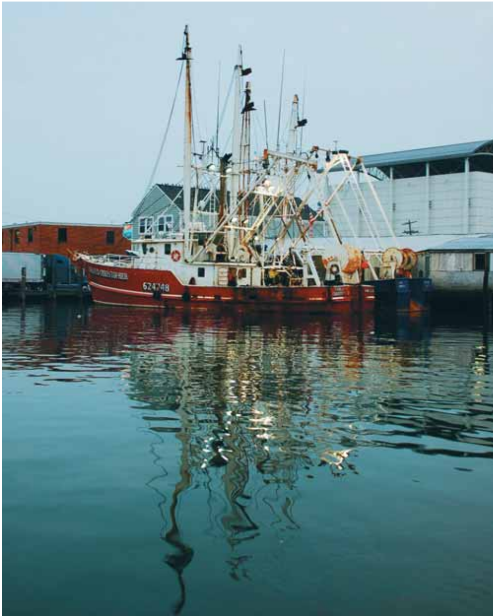
Commercial fishing boats mix with charter craft and private vessels at Hampton's marinas and docks.

Virginia Air and Space Center on Settlers Landing Road, next to the Crowne Plaza Hotel, has wonderful displays of early NASA ventures including the Apollo 12 Command Module that went to the moon, and many old airplanes including a 1903 Wright Flyer replica and a real DC-9.