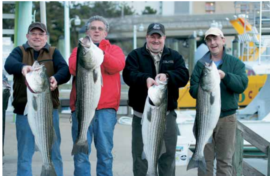
Just some of the rewards after a great day on the water

It's a solid hour or more at 20 knots before we reach the fishing grounds. As we approach, Jimmy, the first mate, readies the tackle. We'll be fishing four rods today: two umbrella rigs to imitate