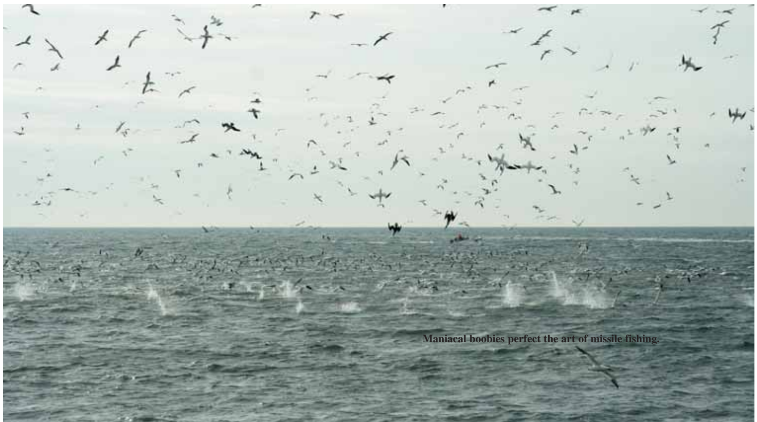
Maniacal boobies perfect the art of missile fishing.