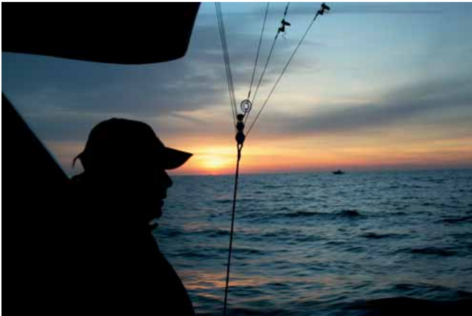
Silhouette at sunrise as we motor out to the Barrier Islands

small schools of baitfish, a white rubber storm swim shad, and a bucktail jig. These last two will be set in the outside rod gimbles and at a farther distance back in the water. It's a tactic to entice opportunistic stripers into thinking they've got slower swimming, weaker prey in their sights.