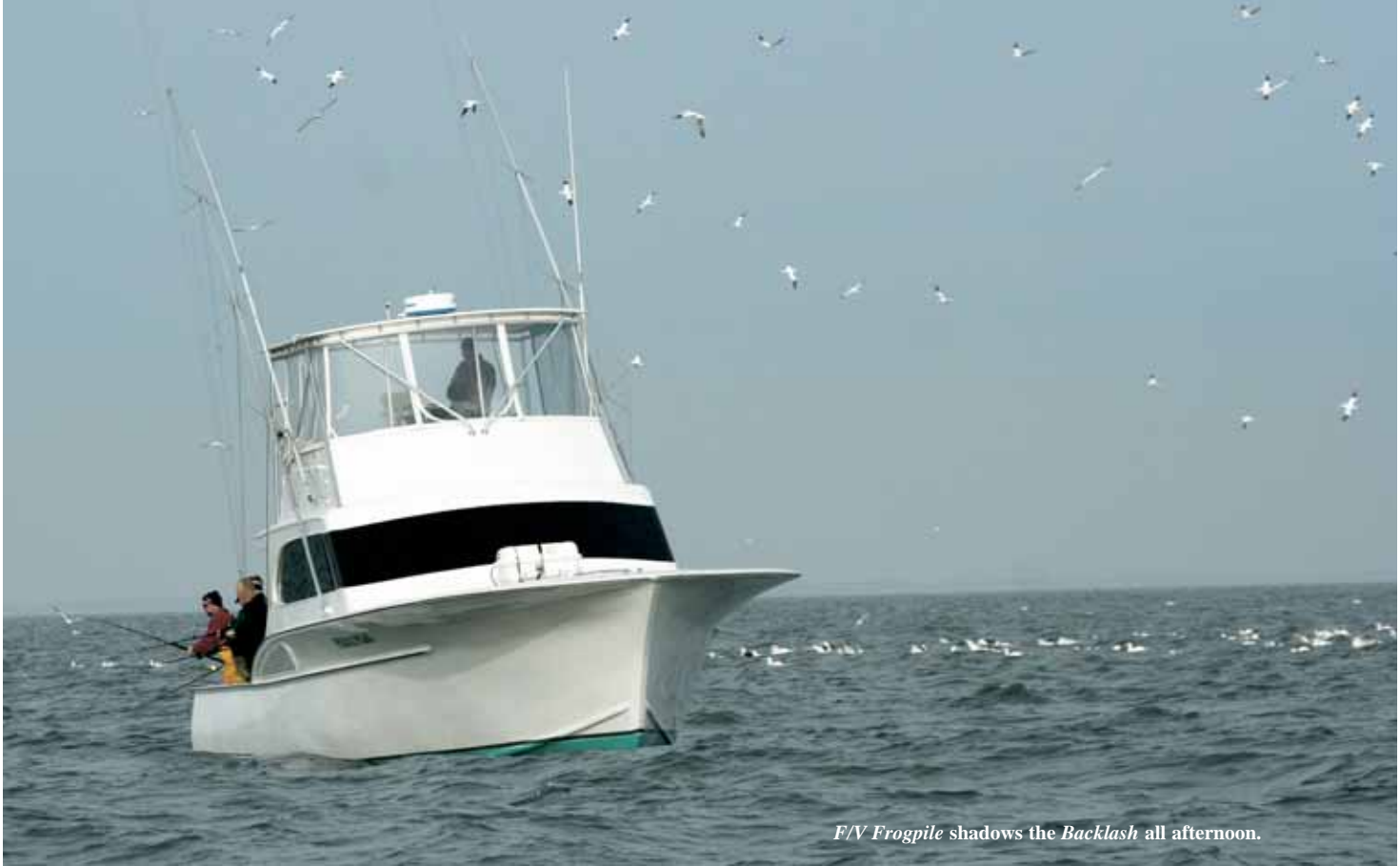
F/V Frogpile shadows the Backlash all afternoon.